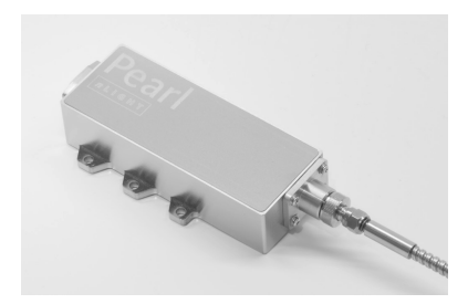
Figure 1. (Left) Photograph of a Pearl module that can hold up to 10 single emitter diodes. The dimensions for this box are 96.5 x 50 x 19.5 mm<sup>3</sup> (Right) A high-power Pearl module with dimensions of 124 \times 50 \times 23 \text{ mm}^3 .